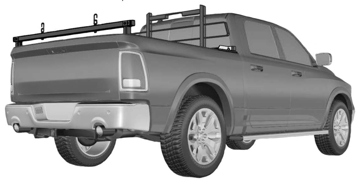
**TRUCK SHOWN MAY NOT BE SAME MAKE-MODEL AS THE KIT YOU PURCHASED**

It is not recommended to use rear bar without tie downs to the truck bed. It is not recommended that the rear bar be left in the stake pockets unless in use with a tie down. Store rear bar securely in truck bed when not in use. The rear bar accessory, in most applications is installed into the stake pockets without a clamp plate and therefore can come lose if not tied down securely to the bed of the truck. This kit includes a bolt plate for permanent installation.